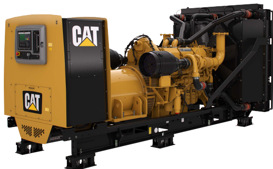
Image shown may not reflect actual configuration